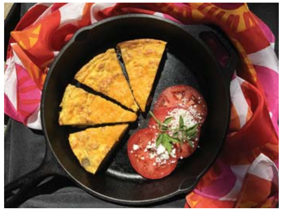
Broccoli Cheddar-Feta Frittata